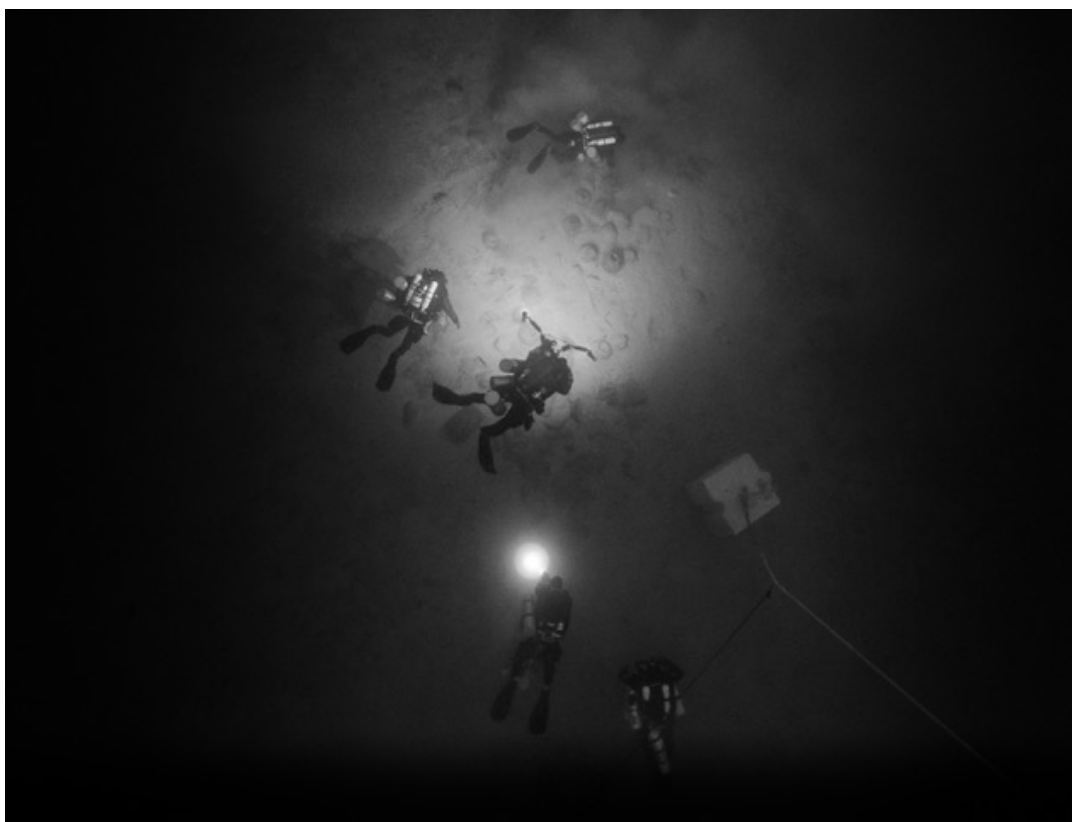
Figure 1. Divers working on the recovery of objects from the shipwreck. The mooring block can be seen on the right

In order to achieve these aims it was essential that dive time was maximised. A one-tonne mooring block was sourced and rigged for mooring purposes. A workboat transported the block and placed it as close to the site as practical. When the block was on the seabed a team of divers used lifting bags to re-position the block in the exact required position. Once in place, the team proceeded to attached a mooring line using chain and shackles. This permitted the master of the dive boat to secure the vessel over the site in the quickest and safest possible manner. The presence of this line ensured that divers were descending straight to the wreck and they could thus exploit the minimal time they had on the shipwreck (see Figure 1 ). Moreover, with the vessel sitting almost directly over the wreck any miscellaneous gear such as the lifting basket could be lowered directly to the site.