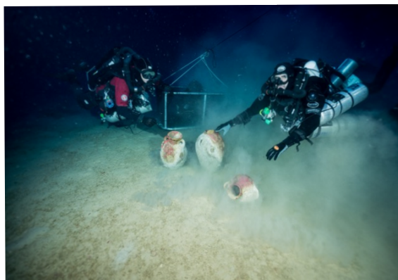
Figure 5. Three unique pieces prepared for recovery from the seabed.