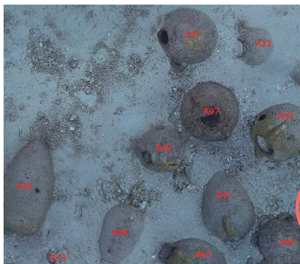
Figure 2. A detail of the digital labelling used on the site.

have had. Due to the depth of the site, traditional underwater methodologies and techniques, such as the manual recording of the site, cannot be employed. This because of the very limited time divers have on the seabed. It was therefore deemed necessary to use a variety of experimental techniques and tools, some of which have been developed by individual members of this team. Since the high-resolution survey of 2014, all objects have been numbered/labelled digitally (see Figure 2 ). All objects on the site are geo-referenced, thus obviating the need for a traditional grid recording system and the physical labelling of objects in situ .