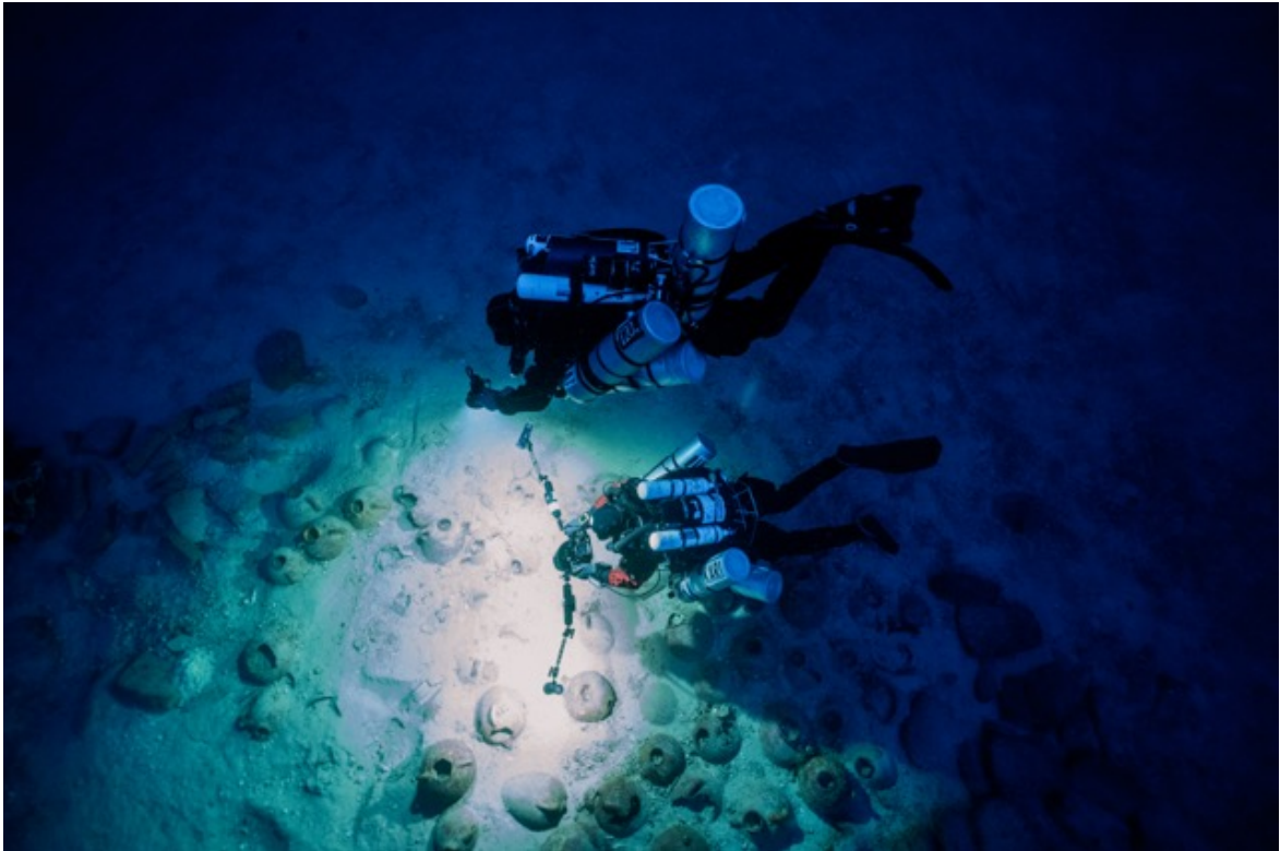
Figure 3. Divers acquiring data for the 3D photogrammetric model.

Following their extraction, the photographs are then processed in Photoscan Pro — a powerful software suite used specifically for the production of 3D photogrammetric models (see Figure 4 ). In turn the photogrammetric model is used to produce models that also integrate 3D scans of recovered objects as well as images that are closer to traditional archaeological recording methods. To date, this process is still being perfected.