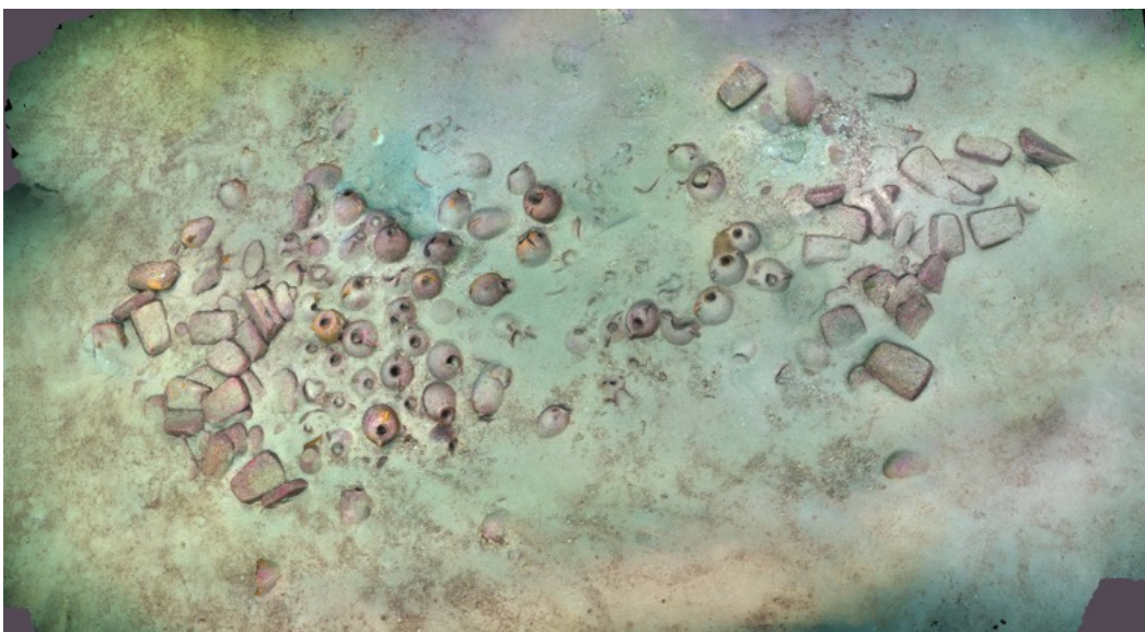
Figure 4. A detailed photomosaic of the site.

Following their extraction, the photographs are then processed in Photoscan Pro — a powerful software suite used specifically for the production of 3D photogrammetric models (see Figure 4 ). In turn the photogrammetric model is used to produce models that also integrate 3D scans of recovered objects as well as images that are closer to traditional archaeological recording methods. To date, this process is still being perfected.