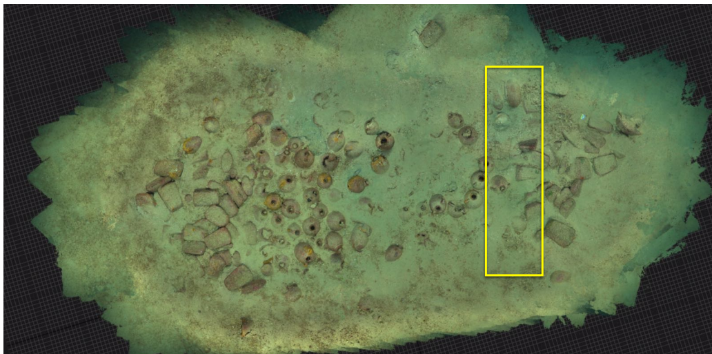
Figure 6. Site for test trench being proposed for 2018 season.

When assessing the project, it is imperative to keep in mind that no manual exists for manually executing archaeological work at such depths and the approaches used and described are a hybrid of established practices and experimental ones. However, this does not mean that the scientific approach may/should be compromised in any way. The combination of factors (i.e. the depth, the lack of an established methodology for working at such depths, and the archeological frameworks within which one has to operate within) means that the rate of progress is necessarily slow. This is especially true when one compares this work to more ‘traditional’ underwater excavation (which is not a fast procedure anyway). However, through the experience garnered over the past two seasons and with the introduction of a purpose-built air lift that will be operated at depth it is envisaged that future work on the site, including the excavation of a test trench (see Figure 6 ), will be expedited.