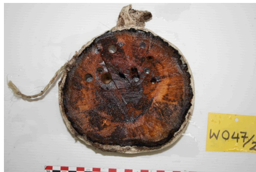
Figure 5: Sampling wood for dendrochronology