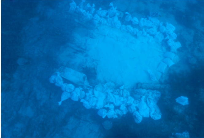
Figure 6: The trench being covered with fine sand.