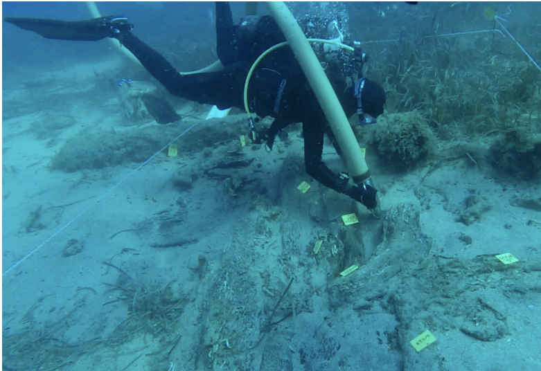
Figure 3: Excavation of the second trench, within the main concentration