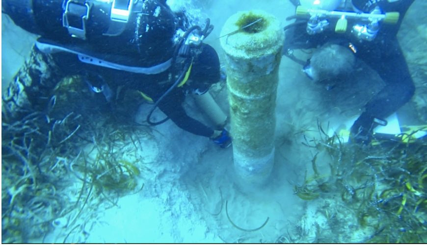
Figure 1: Excavating the cannon