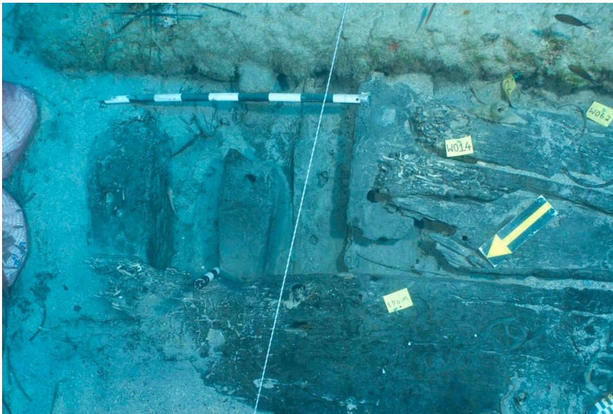
Figure 4: Excavation of the second trench, in the concentration