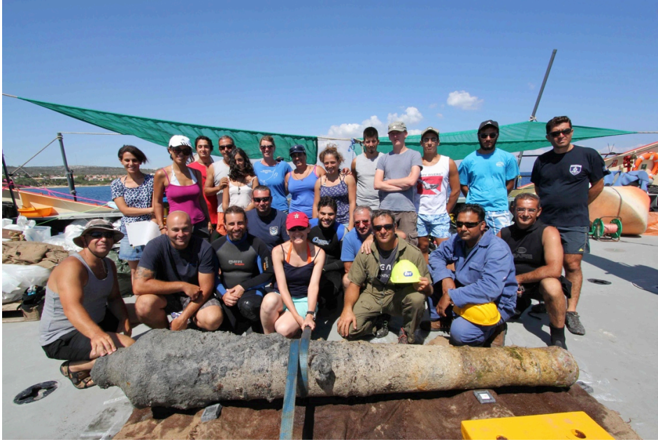
Figure 8: The Nissia Shipwreck Project 2014 team.