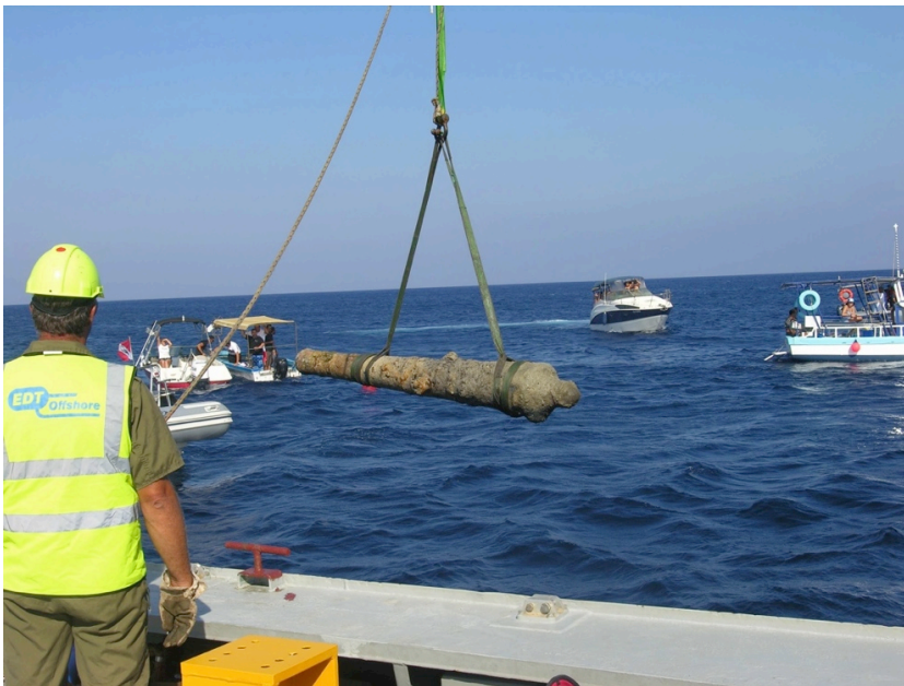
Figure 2: Lifting the cannon