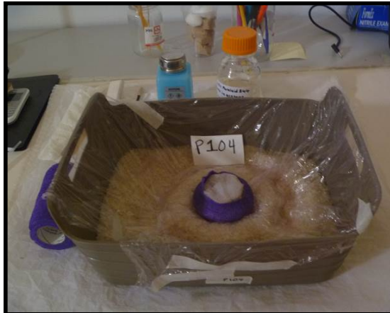
Fig. 5: Photograph of ceramic P104 after reconstruction. The purple bandage was placed over the object to provide tension while the adhesive set.