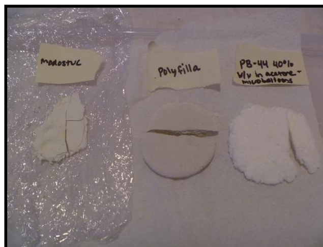
Fig. 2: Photograph of three types of filling materials tested for restoration (Photograph courtesy of Cassy Cutulle, 2016).

As desalination and drying has been completed for some of the ceramics, plans and the testing of materials for the reconstruction and restoration of these objects has been carried out. First, a list was created to detail which ceramic objects will be reconstructed and restored and to what degree. This list will be used to consult with the Project Team about future restoration plans.